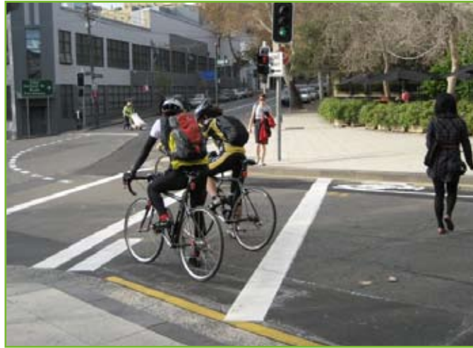
Cycling to work or part of the way to work instead of driving is one way you can help to make a positive difference

Learn how to be water wise and energy smart; how to reduce chemical use and waste, recycle, tread softly and enjoy the outdoors; and discover alternative transport options and volunteering opportunities.