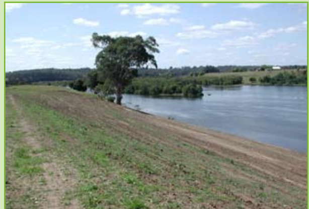
Sea level rise will result in inundation of low lying land such as this

http://www.greenhouse.nsw.gov.au/data/assets/pdf_file/0007/7828/NorthernRiversDetailedFinal.pdf