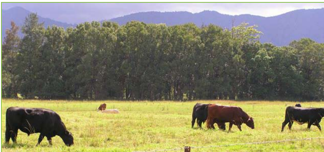
Farmers will need to be prepared to deal with the predicted impacts of climate change, source: OceanWatch Australia