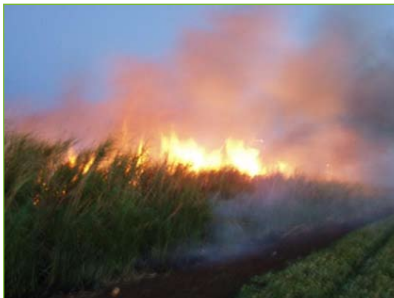
Clearing land through burning also generates considerable greenhouse gases, source: OceanWatch Australia

The main greenhouse gases are water vapor, carbon dioxide, methane and nitrous oxide all of which occur naturally in the atmosphere. Nevertheless, this trapping of heat energy is known as the 'greenhouse effect' and keeps earth temperatures higher than they otherwise would be; much the same as the glass sheets on a greenhouse keeps the plants inside warm. Without this natural process, the global average surface temperature would be closer to minus 18°C, instead of the current +15°C average.