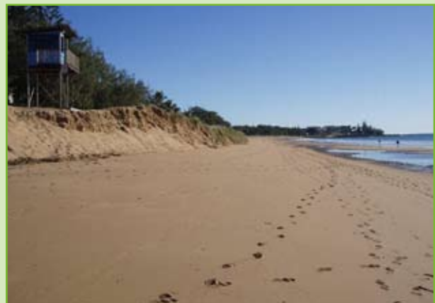
Beach erosion from storm surge is predicted to become more severe as a result of climate change