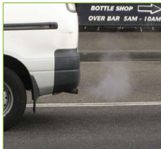
Vehicle emissions are a major contributor to elevated greenhouse gas concentrations