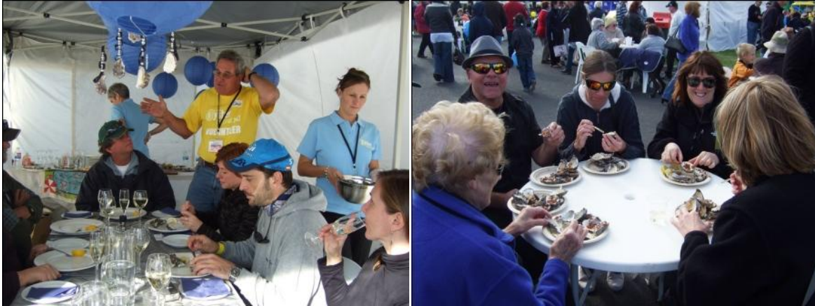
Enjoying the Narooma oyster festival!

-“I really enjoyed the event, great set-up and very interesting. The oyster farmer made it so interesting” – Sydney visitor