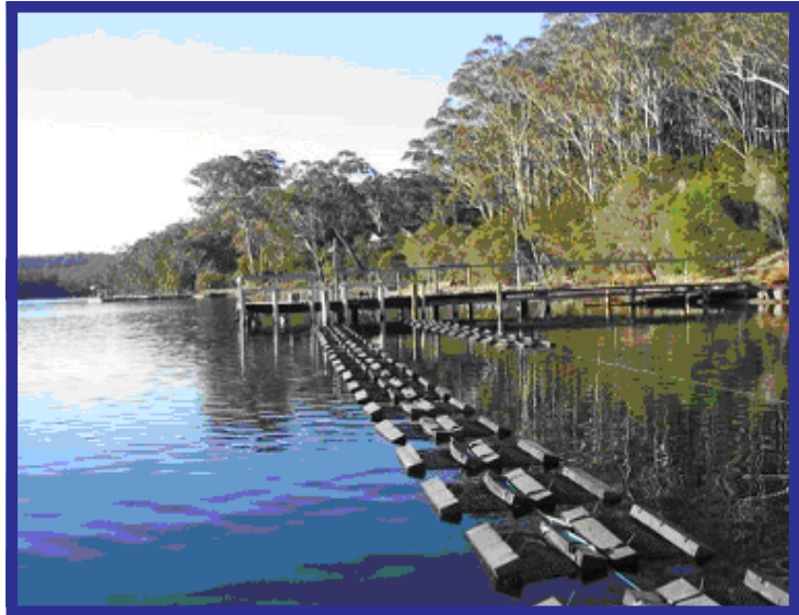
Floating bag oyster cultivation on Wonboyn Lake. Wonboyn Oysters Pty. Ltd. used EMS as a means of documenting major infrastructure changes removing tarred and treated timber.

Many environmental improvements in operations rely on the initiative, time, effort and funding of individual fishers. The Department of Agriculture, Fisheries and Forestry has developed a scheme, managed by Centrelink which aims to offset expenses that often limit changes in practice. The EMS Incentives Program encourages the adoption of sustainable management practices by providing primary producers with a cash reimbursement of up to 50% of the cost associated with developing and implementing an EMS. The maximum reimbursement payable under the program is $3000.