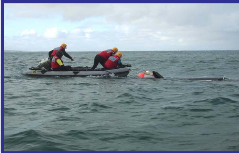
Rescue team cutting free entangled ropes and buoys from the training drogue.

It is hoped that further training workshops will be held in the summer months with the opportunity for fishing industry involvement. SeaNet will seek to rally commercial fishers interested in the program to attend and improve their understanding of the theory behind disentanglement operations, with the potential for future involvement in support roles for entanglement responses in their region.