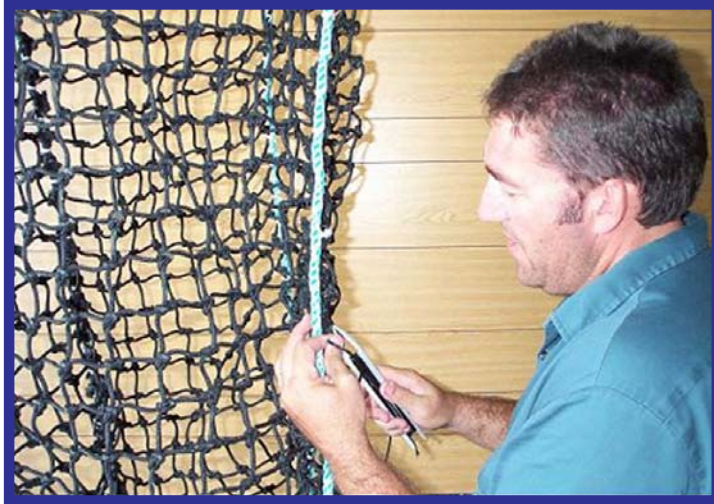
Figure 1. This square mesh codend was used in a research charter in the Queensland scallop fishery in 2002. The 12mm polyethylene rope was used to take the weight of the catch, reducing knot slippage and distortion. The squares were 50mm x 50mm.

Recent research has shown that square mesh codends can be very effective at reducing bycatch and regulating the size of target species such as prawns and scallops. Diamond mesh codends used by the majority of trawler operators close up whenever the net is under any appreciable load, but square mesh codends remain open and allow bycatch (i.e., small fish, invertebrates) to escape. By regulating the size of the square meshes, the selectivity of the prawns and scallops can also be controlled more effectively.