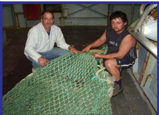
South-east trawl fishers with a modified T90 panel codend.