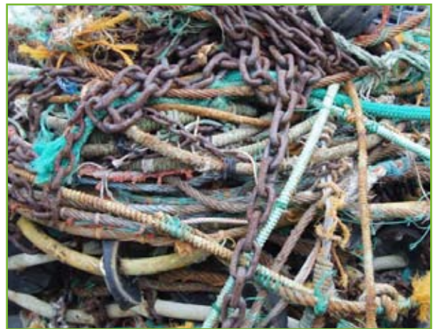
Fishing waste, source: OceanWatch Australia