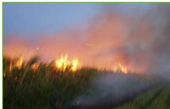
Fire was used as a tool in the past to address pests on sugar cane fields, however it is not such a common practice now, source: OceanWatch Australia