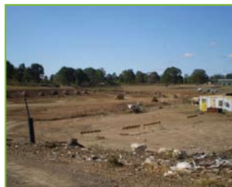
New Grafton landfill during construction, source: Clarence Valley Council

In 2005/2006, industrial and commercial waste made up 36% of the total waste stream for the area. Most of this waste was generated in urban centres such as Grafton, Maclean and Yamba. Not all of this commercial and industrial waste ends up in landfill, with about 38% was diverted for recycling or other uses.