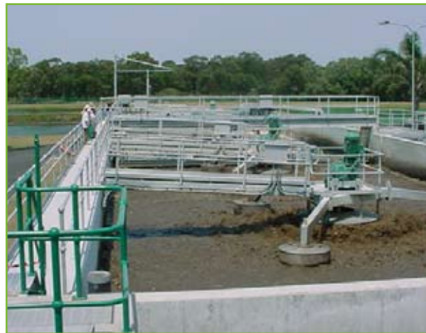
Sewage treatment plant at Yamba

Some of the identified high risk or high volume of waste producing activities require a special licence from the Department of Environment and Climate Change (DECC). These activities or businesses are said to be ‘scheduled’ e.g. concrete batching plants, STPs and intensive agriculture - such as piggeries and feedlots above a certain size.