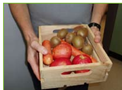
Buying fruit and vegetables loose, source: OceanWatch Australia