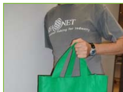
Taking your own re-usable bag shopping