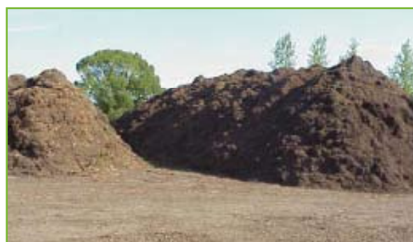
Mulched green waste

The Business Waste Reduction strategy identifies the producers that create the most waste and then assists them in reducing waste generation and waste disposal to landfill. Grafton gaol and Acmena Juvenile Justice Centre have carried out waste audits and developed management to reduce waste levels. The project has been successful in achieving waste reduction and financial savings for the participating businesses and at the same time reducing environmental impacts.