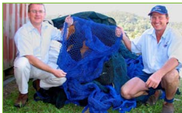
Fishers in the Clarence collecting nets for recycling as part of OceanWatch Australia’s “Fishing for Waste” Program