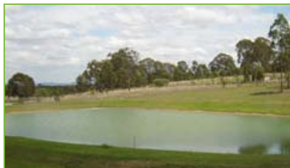
Leachate and sedimentation dams at Grafton landfill, source: Clarence Valley Council