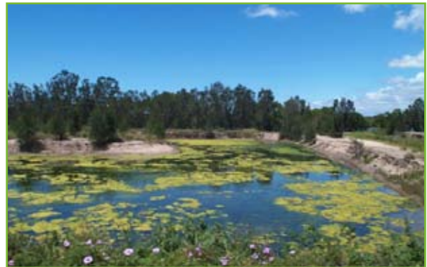
Abandoned prawn farm, Lower Clarence River

Investigate Vibrio and oyster depuration, STPs operated by Clarence Valley Council their location and processes how do the non sewered areas of Clarence Valley treat their effluent.