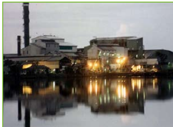
Harwood Sugar Mill located next to the river

Those Clarence River industries that are licensed to dispose of their liquid wastes directly into the Clarence River include aquaculture (prawn farms), sewage treatment works and timber mills. The Harwood Sugar Mill has the largest water discharge rate to the Clarence River, however this is primarily river water used for cooling and the nutrient input from this source is relatively small. The DECC licensing schemes usually contain incentives to reduce the level of contaminants entering the waterway including hefty licensing fees. These fees collected by DECC are directed back into improving the environment through the Environmental Trusts.