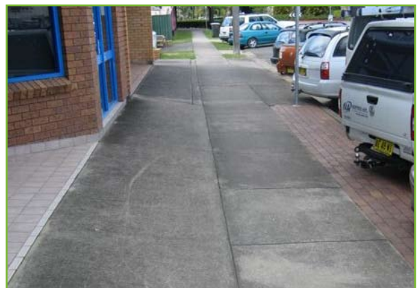
Hard stand surfaces in Grafton town centre