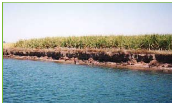
Runoff from agriculture can be a major source of nutrients