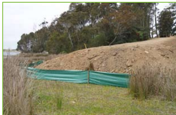
Sediment curtain in place to help stop soil from washing into nearby creeks

For example, water which runs off building sites, carries pollutants like soil and soil nutrients, as well as building materials such as concrete residues, and enters stormwater drains with subsequent pollution of natural waterways. Furthermore, changes that are made to natural land surfaces and drainage patterns during construction and urban development can result in natural watercourses becoming turbid, silted, littered and undesirably enriched with nutrients (eutrophication). This nutrient-rich water often develops algal blooms. When turbid water restricts sunlight filtration, photosynthesis is reduced and productivity of the aquatic ecosystem suffers. This affects habitats (particularly seagrass), marine life and has negative consequences for the fishing industry.