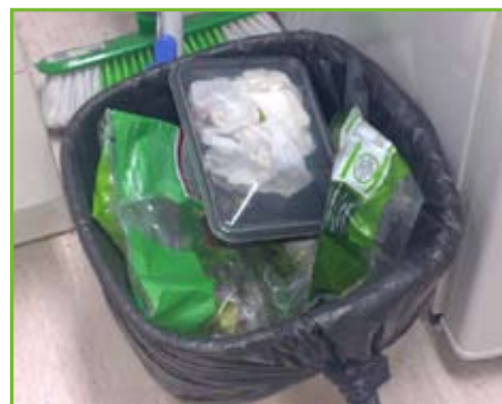
Household waste with lots of packaging