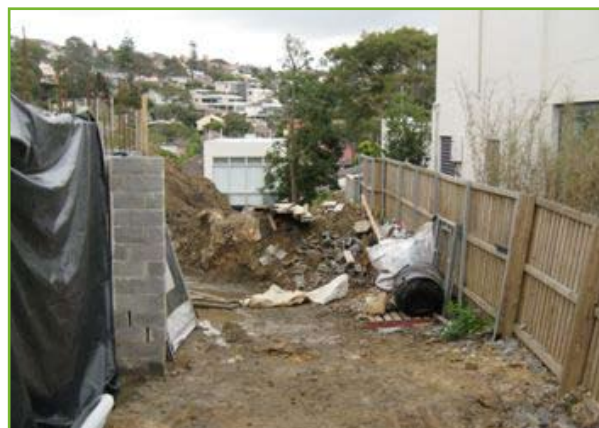
Soil erosion on building and infrastructure sites can be a major source of sediment pollution in waterways. A single building block can lose four truckloads of soil in one storm event

Thus, there are a number of environmental impacts directly associated with pollution from building sites.