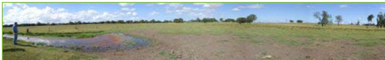
Drained backswamp for agricultural use, source: Clarence Valley Council

Grazing cattle requires extensive areas of grassland for pasture. This not only requires an initial clearing of land but also results in progressive loss of tree cover of adjoining areas because seedlings are eaten by stock.