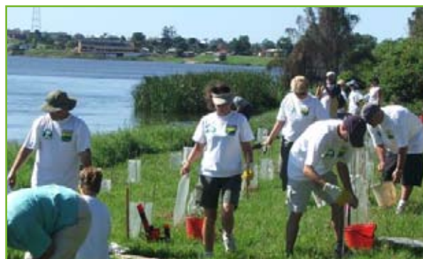
Volunteers planting trees next to waterways