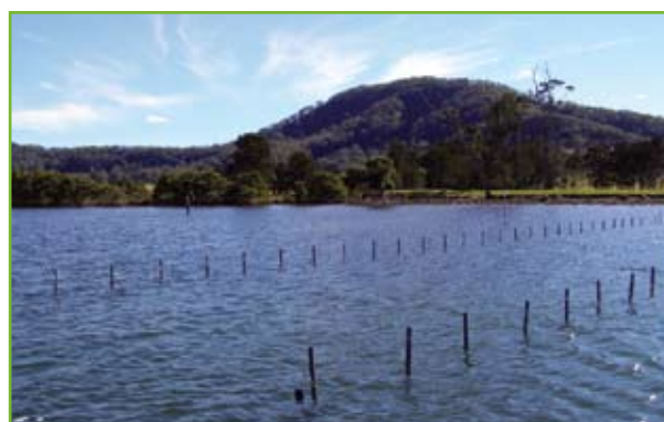
Oyster leases in the Shoalhaven River