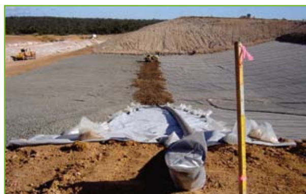
New landfill, West Nowra, source: Shoalhaven City Council

A total solid waste stream of 91,000 tonnes from households and businesses was produced in 2006/2007 in the Lower Shoalhaven River Catchment, with most waste coming from packaging. See Shoalhaven Waste Management data at