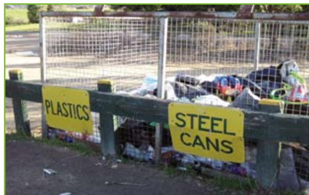
West Nowra waste and recycling depot, source: OceanWatch Australia

Shoalhaven Water is developing one of the largest water-recycling schemes undertaken by an Australian water authority. It will utilise up to 80 percent (2,000 million litres) of the reclaimed water from six Shoalhaven wastewater treatment plants to irrigate local dairy farms, golf courses and sports fields.