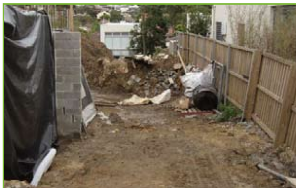
Exposed soil at a construction site

Thus, there are a number of environmental impacts directly associated with sediment pollution from