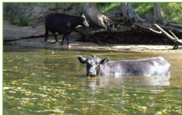
Cattle with direct access to the river, pollute the water with their waste, source: NSW DPI (Allan Lugg)

The oyster industry itself has several waste products that need to be carefully managed. Traditional oyster farming practices have relied on tar-coating oyster poles and trays to preserve the timber. This tar poses a potential risk to the river's water and sediment by gradually leaching toxic chemicals such as hydrocarbons. However, many oyster farmers have replaced the tar-coated poles and trays with recycled plastic poles and floating baskets. Around 70% of the Shoalhaven oyster farmers have already undertaken this. The SRCMA has also partnered with the oyster industry in a one-off clean up of derelict oyster leases with over 40 tonnes of rubbish removed and 20 tonnes of timber recycled from the Shoalhaven.