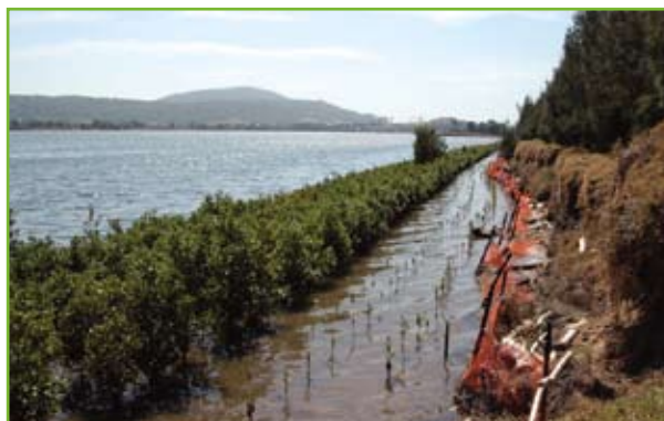
Planting mangroves to help stabilise eroding banks of the Shoalhaven River