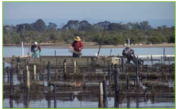
Oyster farming in the Shoalhaven using recycled plastic poles and trays

Air quality in the Shoalhaven Valley is influenced by bush fires, controlled burning for hazard reduction, industrial discharges both licensed and unlicensed, solid fuel heaters, backyard burning of green waste, transport pollution including private vehicle use, commercial cooking activities, sewage treatment plants, landfills, dust from agriculture and building activities, and indoor air pollution from activities such as smoking and heating.