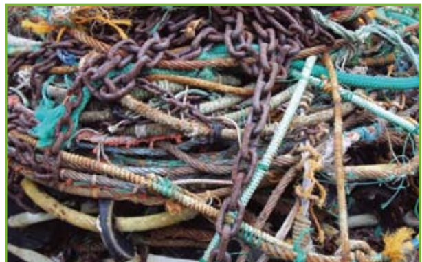
Fishing waste