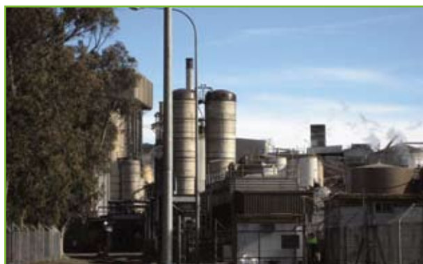
Starch plant also located next to the Shoalhaven River