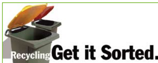
Shoalhaven City Council's educational slogans

Education for sustainability is a state-wide initiative that recognises the vital role education has across all sectors of the community. Shoalhaven City Council, in recognition of its important local role in educating its community, undertakes a variety of community education programmes to advance awareness, uptake and participation in Council's environmental initiatives including the area of waste reduction.