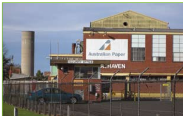
Australian Paper Mill located next to the Shoalhaven River