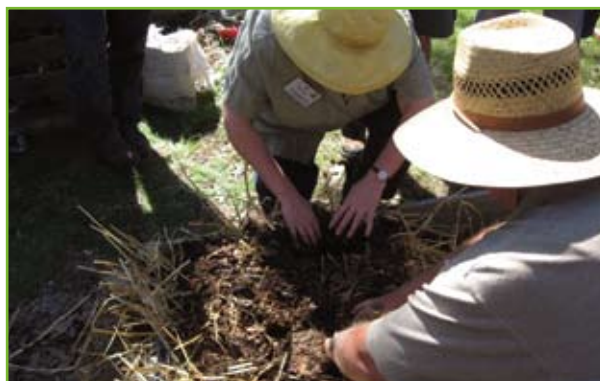
Shoalhaven City Council's community workshop on composting

Councils, schools, State and Commonwealth Governments along with individuals have a responsibility to educate themselves and others about how to improve waste impact from their own activities on the environment.