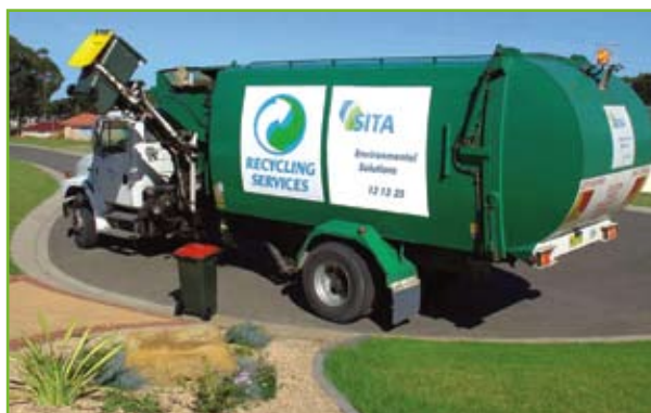
Shoalhaven City Council collection of recycling bins

In NSW, the Department of Environment and Climate Change (DECC) is the lead government agency responsible for state-wide regulation of waste management. Local government is vested with the regulatory responsibility at the local level for carrying out waste management services within this state-wide framework. The Commonwealth Government is also involved through incentives and partnerships with Local and State Governments, as well as with industry. Councils develop policy and operating plans to ensure that they meet their obligations under legislation.