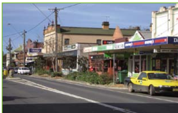
Runoff from urban areas can result in nutrients being washed into Shoalhaven River via gutters, source: OceanWatch Australia

Nutrients, in small amounts, are required for plant growth but in large amounts they can cause excessive algal growth in waterways (including noxious blue green algae) which can put natural ecosystems out of balance, harming water-life and animals. Blue-green algal growth can also seriously affect human uses of water for purposes such as drinking, recreation, stock water and irrigation.