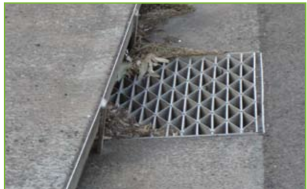
Kerb and gutters in Nowra streets, source: OceanWatch Australia