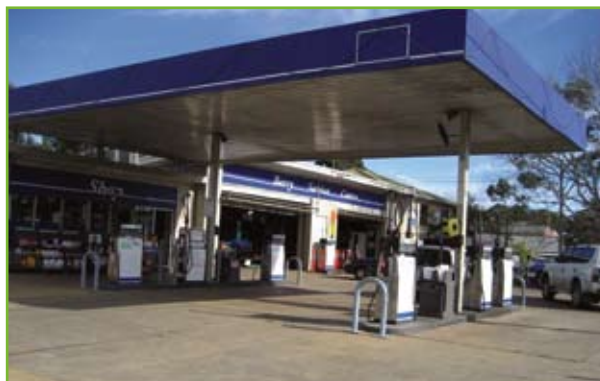
Service station, Berry, source: OceanWatch Australia

Those Shoalhaven River industries that are licensed to dispose of their liquid wastes into the Shoalhaven River include a paper mill, starch plant and STPs. The DECC licensing schemes usually contain incentives to reduce the level of contaminants entering the waterway, including hefty licensing fees. These fees collected by DECC are directed back into improving the environment through the NSW Environmental Trusts.