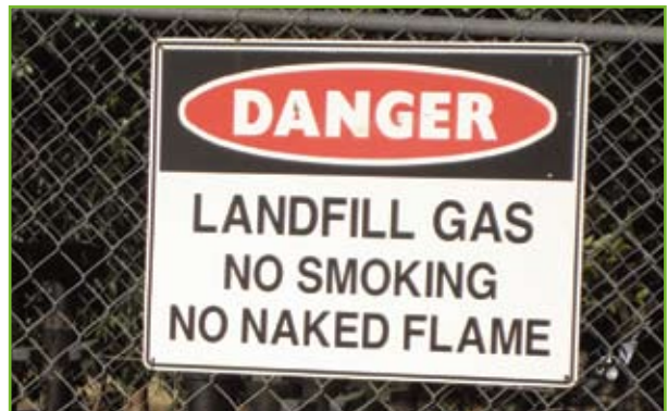
Landfill generates methane, a flammable greenhouse gas