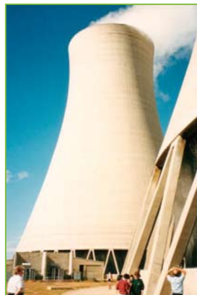
Coal fired power stations generate considerable greenhouse gas emissions

The problem the planet now faces is that human activities, particularly burning fossil fuels, agriculture activities, land clearing and pollution of oceans, is resulting in a rapid increase above the 'normal' concentrations of the greenhouse gases in the atmosphere. Since 1750, the amount of carbon dioxide in the atmosphere has risen approximately 35%, and the current concentration is higher than at any time in at least the past 650,000 years. The level of nitrous oxide has also risen 17% and methane 151%. Scientists assert that there will be continued warming and a resulting rise in sea levels. This would obviously have significant impacts on both natural systems and human activities. (From Climate change in the Northern Rivers Catchment, CSIRO, 2007).