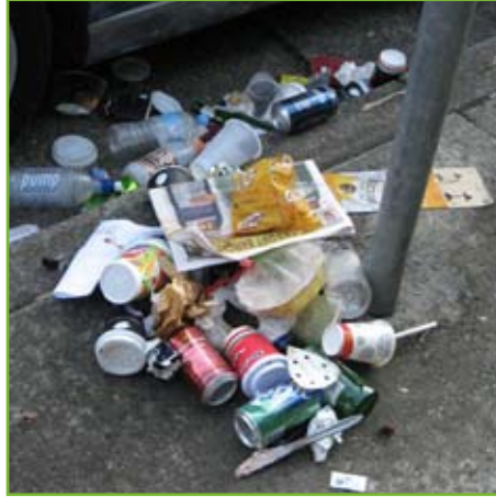
Solid waste