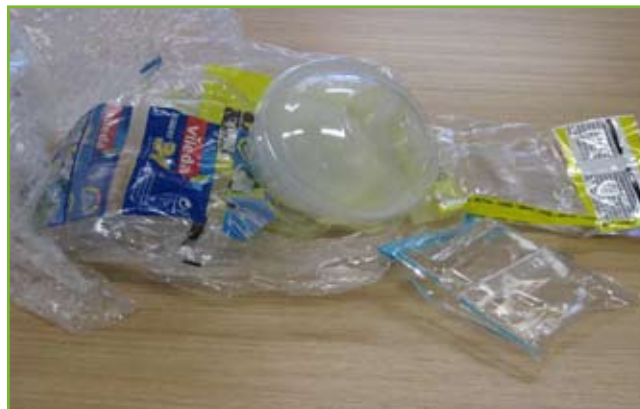
Example of packaging waste, source: OceanWatch Australia

DEW is working with each sector to develop programs in partnership with industry and other stakeholders. One example is the product stewardship in the oil industry ( Product Stewardship (Oil) Act 2000 ), which has resulted in a 37% increase in the amount of oil recycled and reused www.environment.gov.au/soe/2006/index.html , http://www.environment.gov.au/