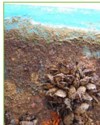
Marine biofouling

The Australian Government has developed an Antifouling Program under the Oceans Policy of the Natural Heritage Trust. This program was set up to help develop alternatives to environmentally harmful Tributyltin (TBT) based