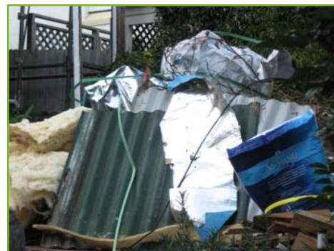
Construction waste

See www.environment.nsw.gov.au/resources/warr/CnDWasteStream.htm