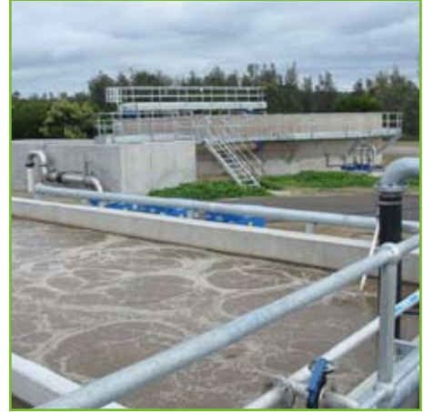
Liquid waste being treated at a sewage treatment plant, source; Bega Valley Shire Council