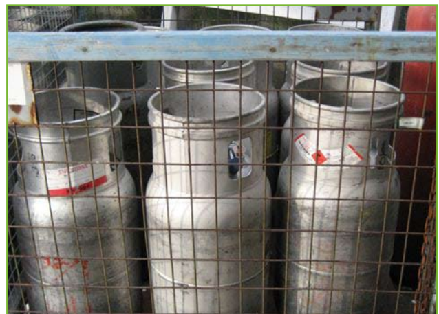
Liquid hazardous waste, source: OceanWatch Australia

The NSW Department of Environment and Climate Change is responsible for regulating emissions and wastes from industrial processes and other activities particularly those that have a designated category or schedule. Such industries and activities must be licensed.