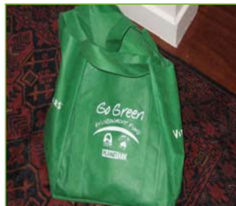
Planet Ark's "Go Green" re-usable shopping bag

Planet Ark has lead the way in reducing the usage of plastic bags in supermarkets. They have developed a reusable shopping bag; that is stronger than the conventional plastic bags. This has helped reduce the number plastic bags going to landfill or ending up in the coastal environment. See www.planetark.com.au for other green solutions to reduce waste.