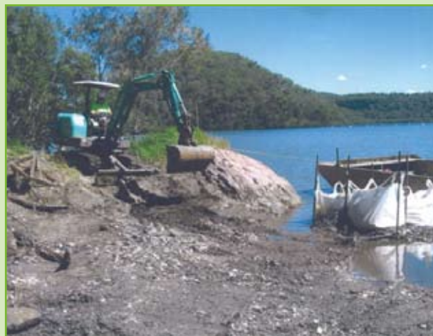
Cleaning up derelict oyster leases, Hawkesbury River NSW