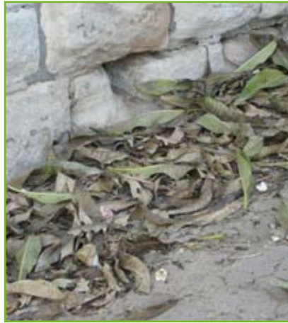
Household green garden waste