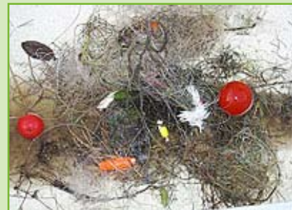
Waste or discarded fishing equipment such as tangled fishing line, torn nets, hooks and ropes etc also pose a threat to aquatic life