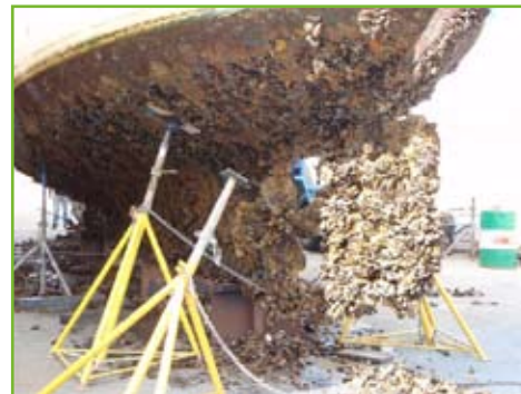
Marine growth can cause fouling of boats and other structures

Boats may also be the source of waste from littering and the inappropriate disposal/treatment of refuse and other wastes by coastal boat users as well as shipping in international waters. Boats also pose a risk to waterway health through the disposal of bilge (i.e. the water that collects inside the bottom of a boat or ships hull) and sullage that includes petroleum products or human effluent. There are strict regulations governing the disposal of wastes by boats. Marinas working on boats and their antifouling methods and paints have serious pollution risks. Some adverse effects of boating include pollution by unburned exhaust gases from power boats, fuel spills and litter. Again water quality is at risk without careful management of these activities.