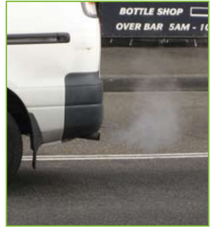
Gaseous waste emissions from a motor vehicle, source: OceanWatch Australia