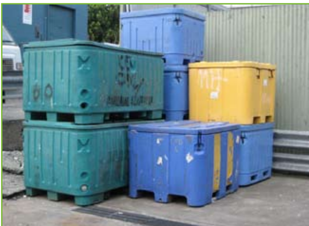
Special containers for the disposal of solid industrial waste