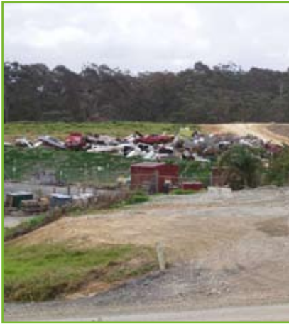
Waste in a landfill, South Coast NSW