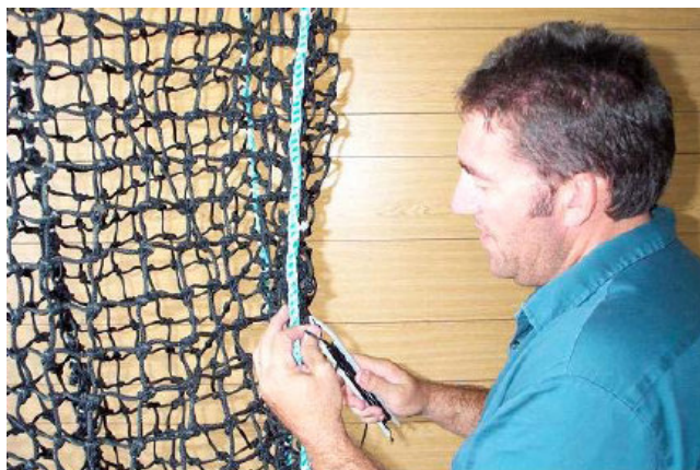
This square mesh codend was used in a research charter in the Queensland scallop fishery in 2002. The 12mm polyethylene rope was used to take the weight of the catch, reducing knot slippage and distortion.

Recent research has shown that square mesh codends can be very effective at reducing bycatch (i.e., unwanted small fish and invertebrates) and regulating the size of target species such as prawns and scallops. Diamond mesh codends used by the majority of trawler operators close up whenever the net is under any appreciable load, but square mesh codends remain open and allow bycatch to escape. By regulating the size of the square meshes, the selectivity of the prawns and scallops can also be controlled more effectively.