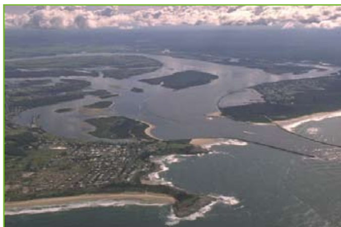
The Lower Clarence River Catchment has many low-lying residential and rural areas which will be subject to inundation from sea level rise, courtesy of DECC