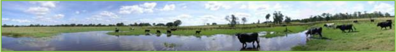
Same wetland with salt couch beginning to grow once month after water works were undertaken to allow water back on the land