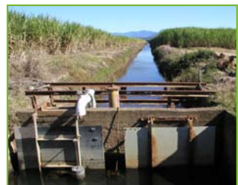
An example of floodgate structures on a drained floodplain, source: OceanWatch Australia

Flood mitigation works have been carried out for over a century on the Clarence, particularly in the 1960s and 1970s. Over the years many extensive drainage systems and hundreds of floodgates and other structures have been constructed. Their purpose has been to provide some protection from floods in both urban and rural areas along with drainage of water from the floodplain for agriculture.