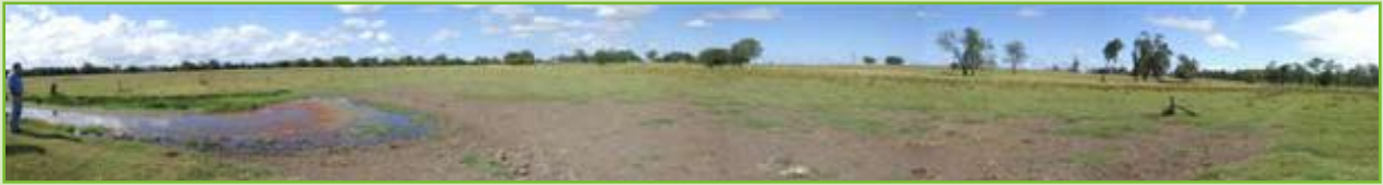
Drained wetland on the Clarence floodplain, source: Clarence Valley Council