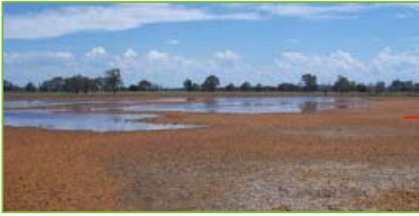
An area of former broadwater wetland showing salt and acid sulfate scalding