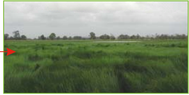
The same area after changes that allowed normal tidal flushing and the removal of cattle. Much of the wetland vegetation is now returning, source: Clarence Valley Council

The Department of Primary Industries, WetlandCare Australia, Department of Environment and Climate Change, Northern Rivers Catchment Management Authority and both Southern Cross and New England Universities also undertook projects to help rehabilitate the wetland (e.g. fencing off wetlands to restrict cattle access).