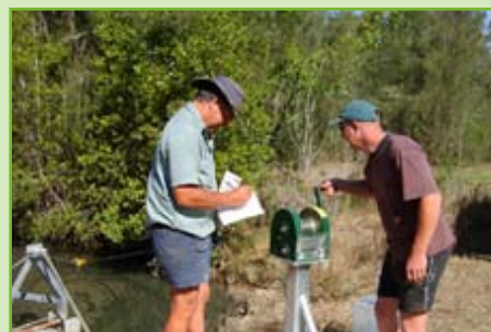
Landholders opening a winch to improve flushing of the drain and thus improve water quality

One important part of the project involved using advanced floodgate technology that allowed flood mitigation structures to be modified to reduce impacts on watercourses in non-flood times, while still providing flood protection. This included tidal floodgates, winches to lift floodgates, 'fish flaps' in weirs and a range of water retention structures used to raise water levels. The installation of automatic and manually winched floodgates meant that habitat areas were no longer shut off from the estuary permanently and salty tidal waters were able to move up into these areas. Mangrove and saltmarsh wetland areas began to regenerate in response to inundation by these saline tidal waters.