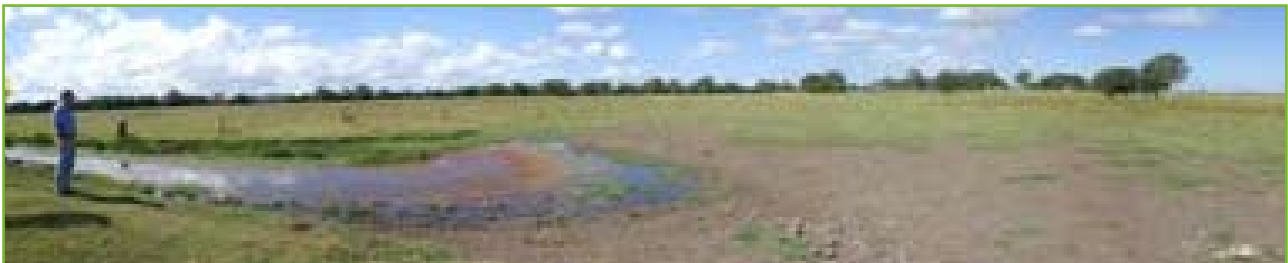
Drained wetland on Bleechmores backswamp, source: Clarence Valley Council

Generally land use and water management options are regulated at a broad scale by Commonwealth and State legislation, and at a more detailed local or regional scale by Council and State Government Departments for such things as approvals for developments and activities. However, it is the actions of individuals at work or at home that can often play a large part in whether the natural resources of a catchment are managed in a sustainable way.