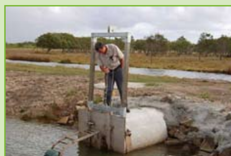
A tidal floodgate with a winch which allows for improved water exchange

The project is mainly funded through State and Federal Government funding grants, through organisations such as the Northern Rivers Catchment Management Authority, Department of Environment and Climate Change, the State Environmental Restoration Trust and Local Council. It is also supported by the Northern Rivers Catchment Management Authority, other NSW Government departments, the Clarence Cane Growers Association, Clarence River Fisherman's Cooperative, North Coast Environment Council, Indigenous Land Councils, the University of New England, Southern Cross University and local landholders and community groups.