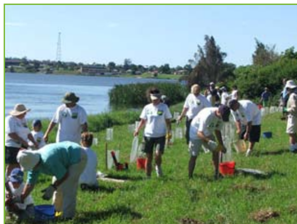
LandCare groups restoring riparian habitat

http://www.clarence.nsw.gov.au/cmst/cvc009/nova.asp