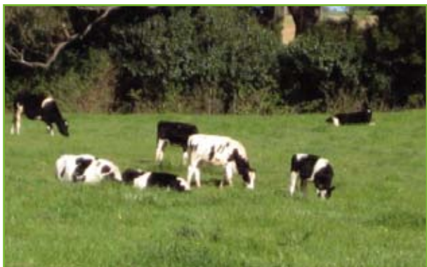
Dairy farm in the Shoalhaven