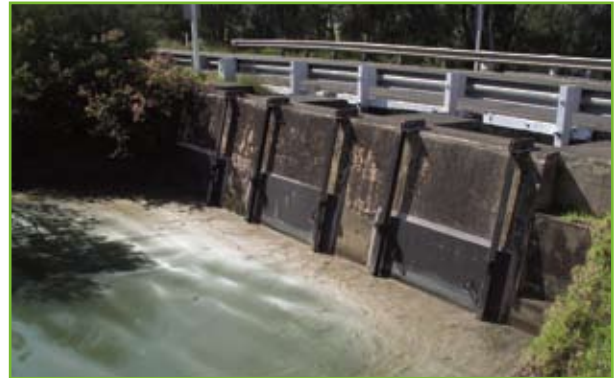
Floodgates on the Crookhaven River

There has been considerable activity throughout the Shoalhaven River catchment to reduce the impacts of fish barriers. For example, the NSW Department of Primary Industries (DPI) and the Department of Water and Energy are conducting research into native fish population movements and changes in the Shoalhaven using electronic tracking devices to determine the status of native fish populations and ways to minimise the impacts of barriers in the River. Also part of the Shoalhaven River Estuary and Rehabilitation Program is to remediate and/or remove identified barriers to fish passage.