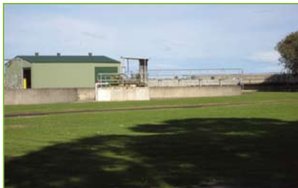
Nowra Wastewater Treatment Plant

There are three STPs – located at Berry, Bomaderry, Nowra – that can have a major impact on the water quality of the Lower Shoalhaven River and estuary. All STPs are licenced polluters and regulated by the NSW Government. Each of these STPs run by Shoalhaven Water, has the highest level (tertiary) treatment. All of the biosolids from the STPs are re-used and 30% of the water from them is re-used.