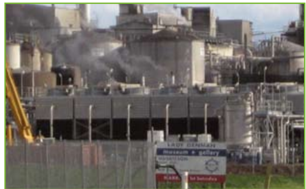
Industry alongside the Shoalhaven River (starch plant)