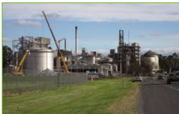
Manildra's Nowra starch and ethanol plant

Some local industries are also taking their own measures to minimise water pollutants emanating from their sites. For example, Manildra's Nowra starch and ethanol plants generate a water based waste stream containing soluble organic nutrients. An environmental