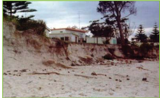
Shoreline erosion