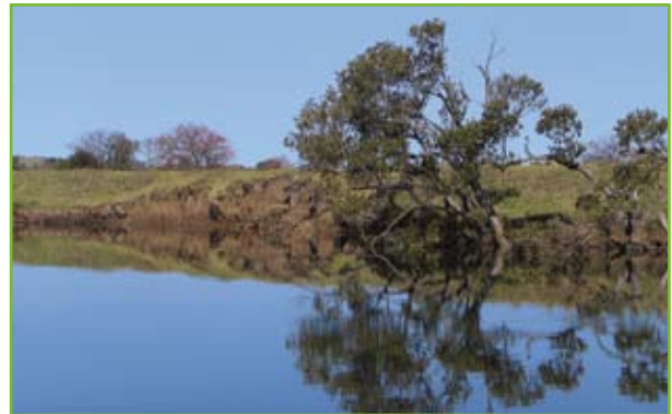
Riverbank erosion Broughton Creek

Several projects have already been carried out to address bank erosion that involve government (Southern Rivers Catchment Management Authority, other state government agencies, Shoalhaven City Council) and local landholders working together.