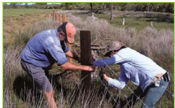
Greencorps team helping landowners fence cattle out of the Shoalhaven River