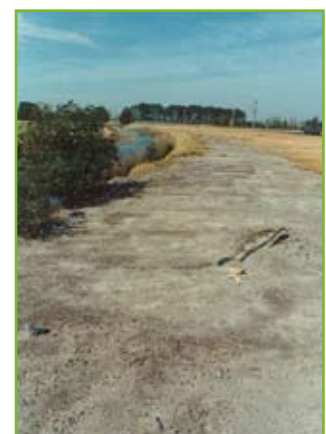
Acid sulfate soils, Greenwell Point