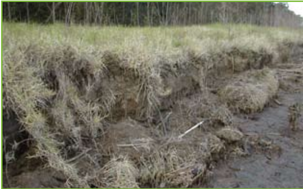
Shoreline erosion, Numbaa Island