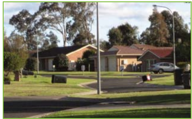
Expanding residential areas in Nowra

ASS have been exposed in the Lower Shoalhaven River Catchment, particularly around Broughton Creek. This has mainly been caused by the draining of low lying land for dairy farming and cattle grazing. The exposure of the soils has led