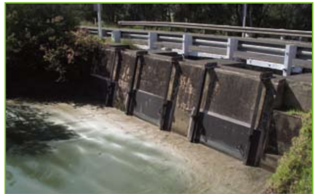
Floodgates on the Crookhaven River