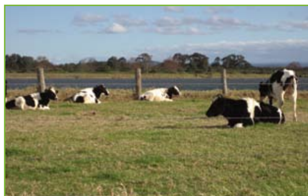
Dairy cattle fenced out from riverbanks near oyster leases

More details about water quality issues can be found in the fact sheets on Waste Management in the Lower Shoalhaven River Catchment and The Lower Shoalhaven River Catchment Fishing Industry.